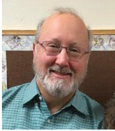
Chip Black Communications