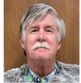
Walter Nelson Building and Grounds