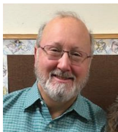
Chip Black Communications