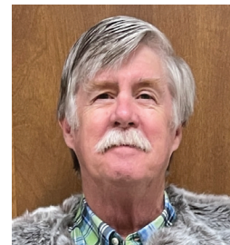
Walter Nelson Building and Grounds